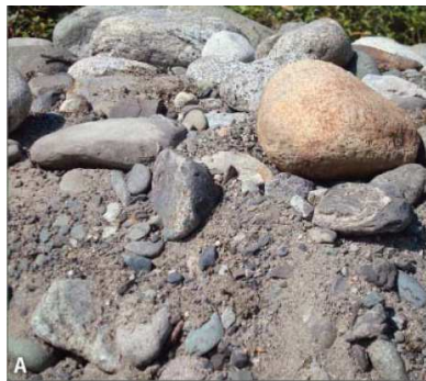
Fig A : River armoring

The originality of this PhD is to combine expertise from two different areas: granular flow mechanics provided by Irstea (ex Cemagref) - Grenoble, ETNA research unit (P. Frey) and image processing provided by Hubert Curien laboratory, Univ. St Etienne / CNRS UMR 5516 (C. Ducottet).